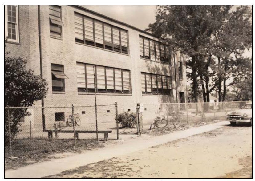
Figure 5. Chicora Elementary School (white), 1955 addition, North Charleston, South Carolina

The equalization schools were designed to take maximum advantage of air flow and natural light in the classrooms. Consequently, as schools began to install central air and heating, school districts viewed the walls of windows as energy deficient and began infilling the openings. School districts no longer wanted to financially maintain the large number of windows that were required as part of the postwar school. Many of the