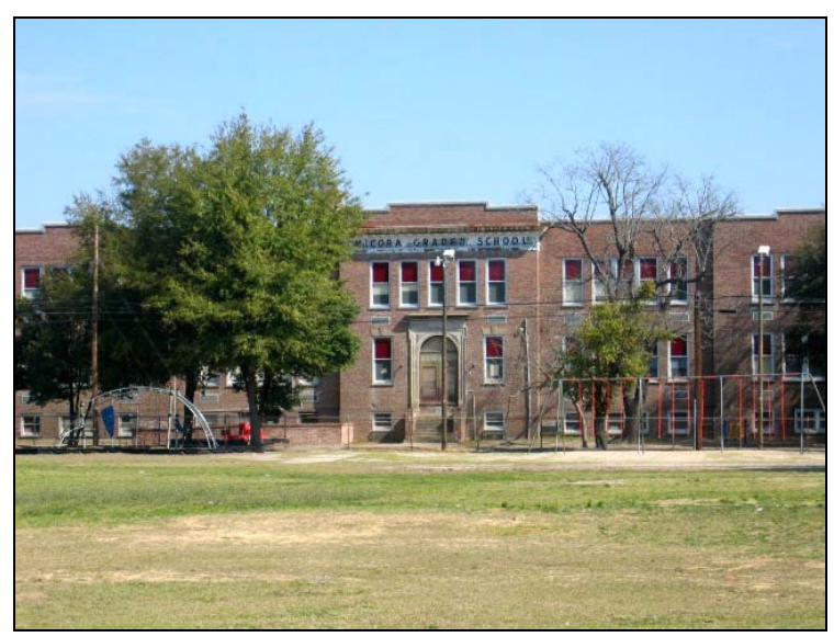
Figure 4. Chicora Elementary School (white), c.1920, North Charleston, South Carolina Photograph by Rebekah Dobrasko, 2005