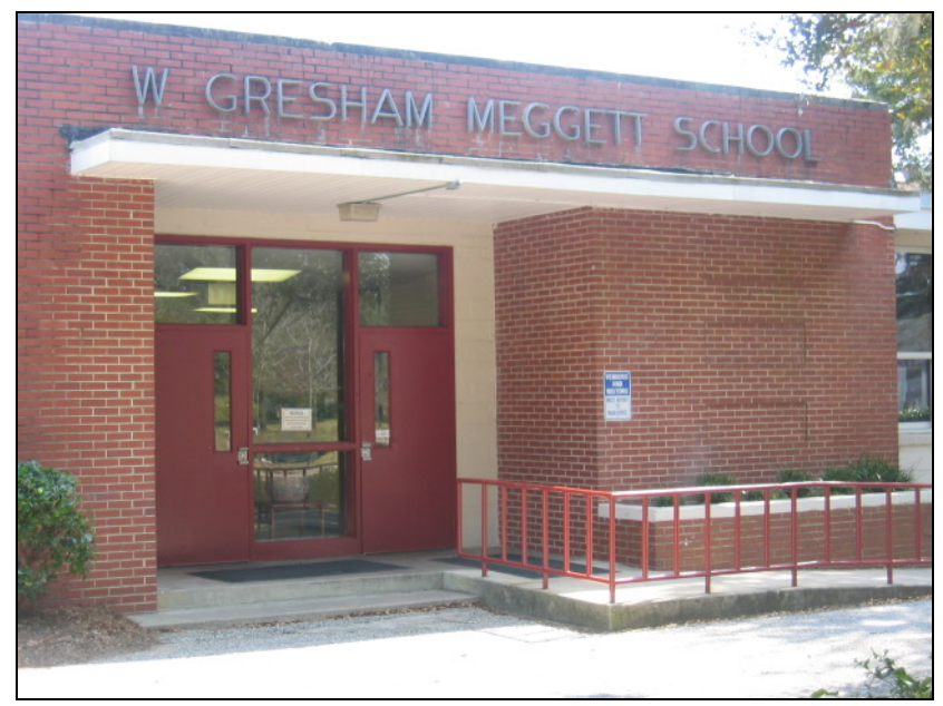
Figure 7. Original Signage for the W. Gresham Meggett High and Elementary School (black), now Septima Clark Corporate Academy, 1953, James Island, South Carolina Photograph by Rebekah Dobrasko, 2005

Additions should be on the side or the rear of the building, and attached by hyphens or walkways. <sup>26</sup> Original signage should also be considered in determining the school's integrity.