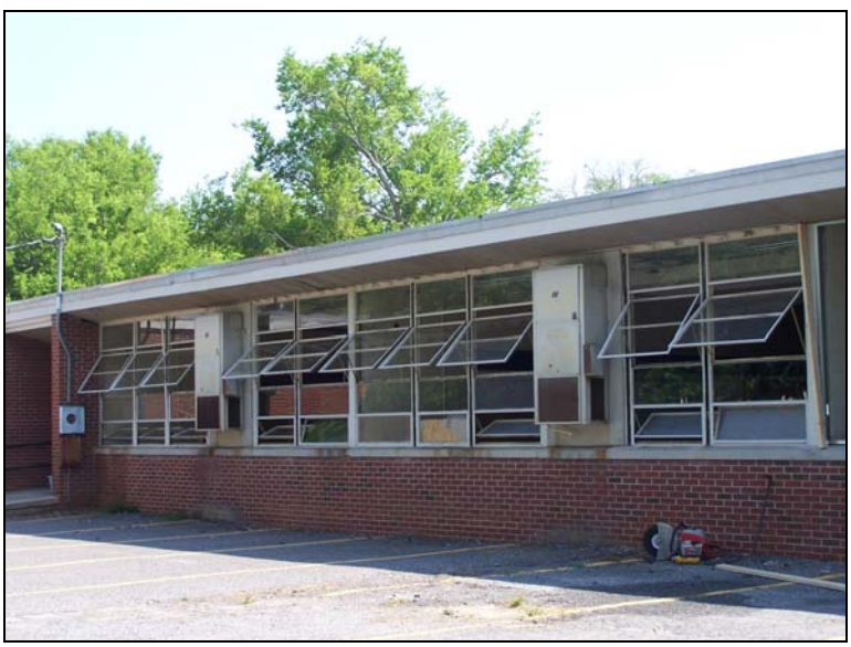
Figure 3. Central Elementary School (white), 1957, Lancaster, South Carolina Photograph by Rebekah Dobrasko, 2007

Many existing schools received substantial additions as part of the equalization school construction program. Although the older portions of the school may not reflect the building trends of the post-war era, the flat roofs, metal windows, and brick veneer clearly identify the 1950s additions. Chicora Elementary School in North Charleston was constructed in the 1920s, and it received an addition in 1955 (Figure 4). The historic section reflects the traditional architecture of the 1920s, and the 1955 addition shows the streamlined, modern architecture popular after World War II (Figure 5). Dennis High School in Lee County is listed in the National Register of Historic Places for its significance in African American education. The Lee County School Board built a Modern addition to the original Classical Revival style Dennis High School as part of its equalization program. This addition contributes to the historic significance of Dennis High.