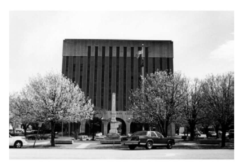
Plate 14: Darlington County Courthouse (site # 0197), built in the 1960s

A monumental change came to the public square in the mid 1960s when the county hired the firm of Lyles, Bissett, Carlisle and Wolff, Architects to design a new courthouse (site # 0197). The firm was well-known in the state for its work including the Thomas Cooper Library (1959) on the campus of the University of South Carolina in Columbia, the Forest Lake Country Club (1963) and the United States Post Office in downtown Columbia (1966). The Darlington County courthouse—a modern edifice which borrows from the classical in its windows which soar vertically like columns—stands in the middle of the square at the location of its predecessors. One architectural critic described the building as "essentially cubical in form and [rising] above a peripheral and boldly proportioned marble arched arcade."