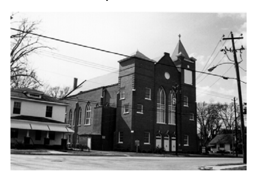
Plate 12: Macedonia Baptist Church (site # 0471), built in the 1920s on South Main Street

impressive churches built during the interwar period was the Macedonia Baptist Church (site # 0471) on the South Main Street. The black congregation's sanctuary originally stood at the northeast corner of Hampton and Main streets, but in the early 1920s the group purchased a lot on the southwest corner of Lee and Main streets. All or part of the imposing brick church had been built by 1924.<sup>57</sup>