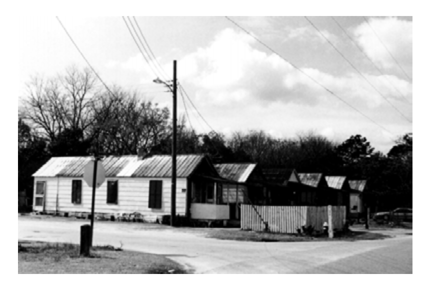
Plate 13: Shotgun Houses Built Circa 1920 Along Third Street

The expansion of local industry occurred so rapidly that in some parts of Darlington there was not enough housing for workers. Developers or the industrial concern often erected inexpensive housing that could be built quickly and on smaller parcels. When the Darlington Veneer Plant opened in the late 1910s, it constructed a group of shotgun houses in a nearby neighborhood, mainly along Third Street (site #s 0444-0466). The shotgun, a narrow, linear house with its front gable facing the street, typically has two or three rooms, but is one room wide. The form originated in the West Indies and was brought to the United States through the port of New Orleans. Although modest in size and detail, the shotgun is an important African American cultural carryover.