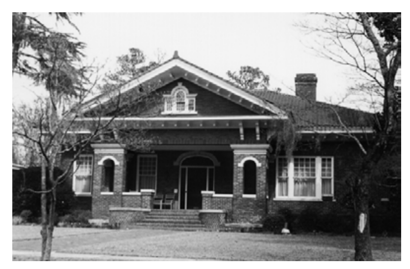
Plate 10: Bungalow (site # 0154) with Mission Influence at 112 St. John's Street

among the leading towns of the State for its beauty. All of the important streets are paved, while all others are generally in good condition....The lawns are attractive and well kept, and the majority of residences neat and appealing. There are also many lovely old homes with spacious grounds that add to the beauty of the community....It has been described as a fine residential city and a good place in which to live.<sup>51</sup>