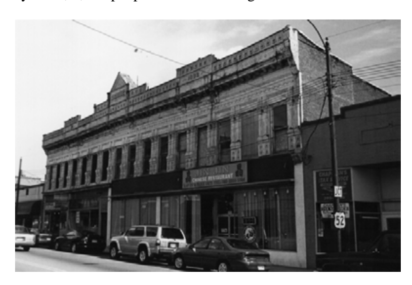
Plate 4: Manne Building (site # 0226) on Pearl Street, built 1892

Darlington underwent a remarkable transformation in the latter half of the nineteenth century. In 1880, the population stood at 940, but only ten years later it grew to 2,389 reflecting an improvement in the town's economy due to the establishment of new industrial concerns. At the turn of the century, the population numbered just over three thousand and by 1910, 3,789 people lived in Darlington.<sup>33</sup>