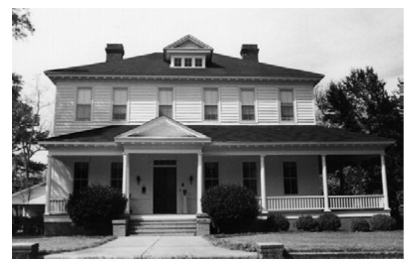
Plate 2: Moses Sanders House (site # 0136) at 114 Sanders Street

The earliest remaining architecture in Darlington dates to the 1830s and reflects the influence of the Federal style. The localized Federal idiom was vernacular in expression, but drew on the elements of classicism which appealed to those just settling in the county's new seat of government. Examples of the style in Darlington exhibit traditional forms and plans with attention to proportion and details like moldings, entranceways and mantels. Although builder's guides—such as Asher Benjamin's American Builder's Companion —were widely available during the period, it is uncertain if any of the Federal period houses in Darlington were patterned after these guides.