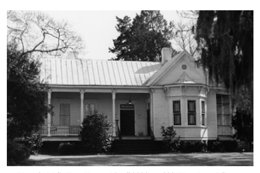
Plate 8: M.S. Hart House (site # 0093) at 393 West Broad Street

The Queen Anne proved the most popular style in Darlington during the period and today the city retains some of the best examples in the region. Pattern books of the day offered the public designs for all types of irregular-massed, cross-plan dwellings. These publications showed pictures of mantels, windows, doors, stairs and porch posts that could be purchased from a manufacturer or produced locally. An especially attractive feature of the Queen Anne style was that it could be expressed in its most animated form or as a modest house of asymmetrical proportions with little ornament.