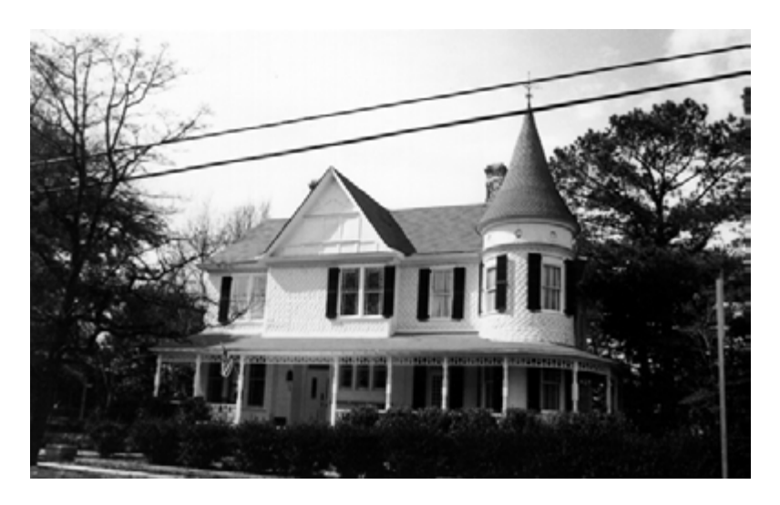
Plate 6: "Drummer's Home" (site # 0259) at 209 Cashua Street

with the Atlantic Coast Line at Florence; the Sumter, Richmond & Danville System at Charlotte and Columbia; the Cape Fear & Yadkin Valley at Bennettsville and the Seaboard Air Line at Hamlet.<sup>39</sup> In the early twentieth century as part of a region-wide consolidation effort, these railroads became part of the Seaboard Coast Line Railroad. Visitors who came by train to town would find commodious accommodations at the Enterprise Hotel which stood on the southwest corner of the public square facing the courthouse or at the James Hotel on Pearl Street. Salesmen could stay at the "Drummer's Home" which was located in an exuberant Queen Anne style house on the northwest corner of Cashua and Spring streets. <sup>40</sup>