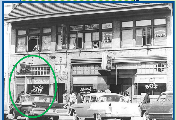
Green Leaf Café, 1117 Washington Street, Columbia.