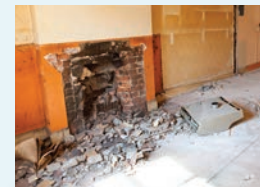
Thermal Boiler & Fireplace Insulations