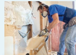
Drywall & Cement Sheets