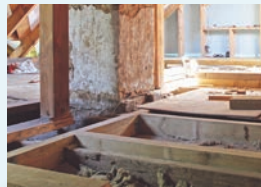
Vermiculite Insulation, Ceiling Tiles & Coatings