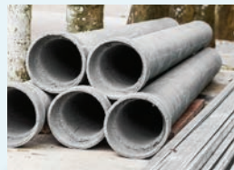
Pipe & Duct Coverings