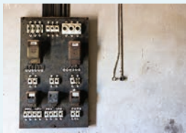
Electrical Switchboard Panels