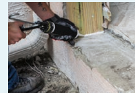
Plaster, Putties & Caulking