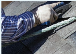
Roof Shingles & Siding

Because asbestos doesn't burn, it was used in many products to resist heat. The "miracle mineral" made these asbestos-containing materials valuable to the building industry.