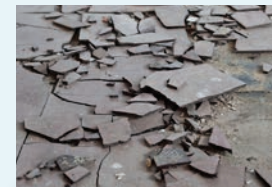
Vinyl Floor Tiles