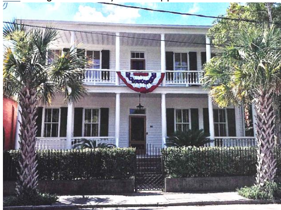
After photograph of the house's façade.

This month's spotlight features a mid-19 th century, two-story wood-frame house located in the Charleston Historic District. Beginning in 2019, the current owners undertook a sensitive rehabilitation that included: repairs and replacement of terracotta, slate, and copper roofing; repointing historic mortar; stabilizing the foundation with additional piers and sistered joists; repairs and replacement of the piazza decking and structure; and increasing energy efficiency of the residence with crawlspace insulation and a new HVAC system in a secondary space of the property. During the rehabilitation, the interior floor plan was preserved and no significant alterations were made. This rehabilitation earned the homeowners a state income tax credit equal to 25% of eligible expenses. For more information about the homeowner tax credit program, please visit this link .