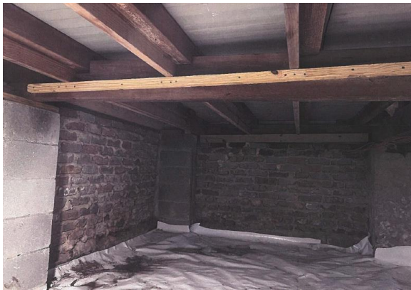
After photograph of the crawlspace, showing sistered joists and historic joists supporting the residence.