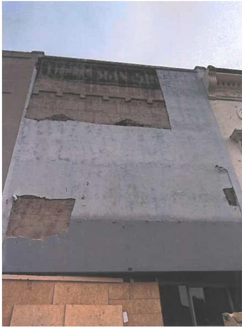
Photograph of the building before rehabilitation.

This month's spotlight features a ca. 1890, two-story, masonry commercial structure located in the Anderson Downtown Historic District. This store building is a contributing resource to the National Register historic district and is typical of commercial structures east and west of the Courthouse Square constructed during the late-19 th century's transition from wood-frame to masonry structures. During the 20 th century, the late-Victorian detailing of the façade, notably the storefront and windows, were removed. With a private investment of nearly $700,000 and federal and state income-producing tax credits, the façade was restored and the interior was rehabilitated with a boutique wedding planner on the ground level and a co-working space on the upper floor. The scope of work included restoring the façade based on historic documentation, repointing with compatible mortar, sensitively upgrading the HVAC and electrical and adding fire suppression, restoring the interior plaster, retaining and restoring the historic bead board ceiling and trim, restoring the hardwood flooring, retaining historic interior doors and designing compatible replacement doors where missing, preserving the historic skylight, and preserving the historic character of the interior layout while rehabilitating the building for new uses. For more information about tax incentives for historic properties visit https://scdah.sc.gov/historic-preservation/programs/tax-incentives .