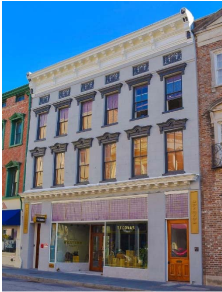
286-288 King Street after rehabilitation.