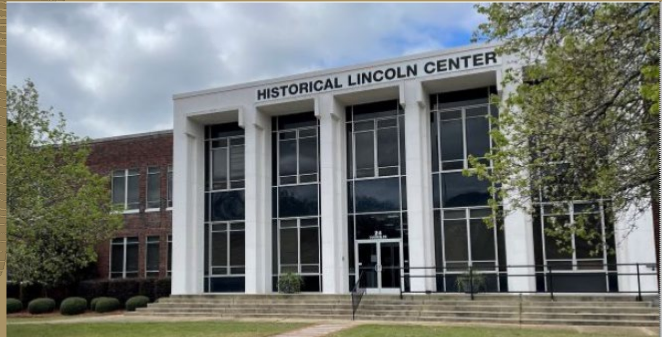
Lincoln High School, Sumter, SC