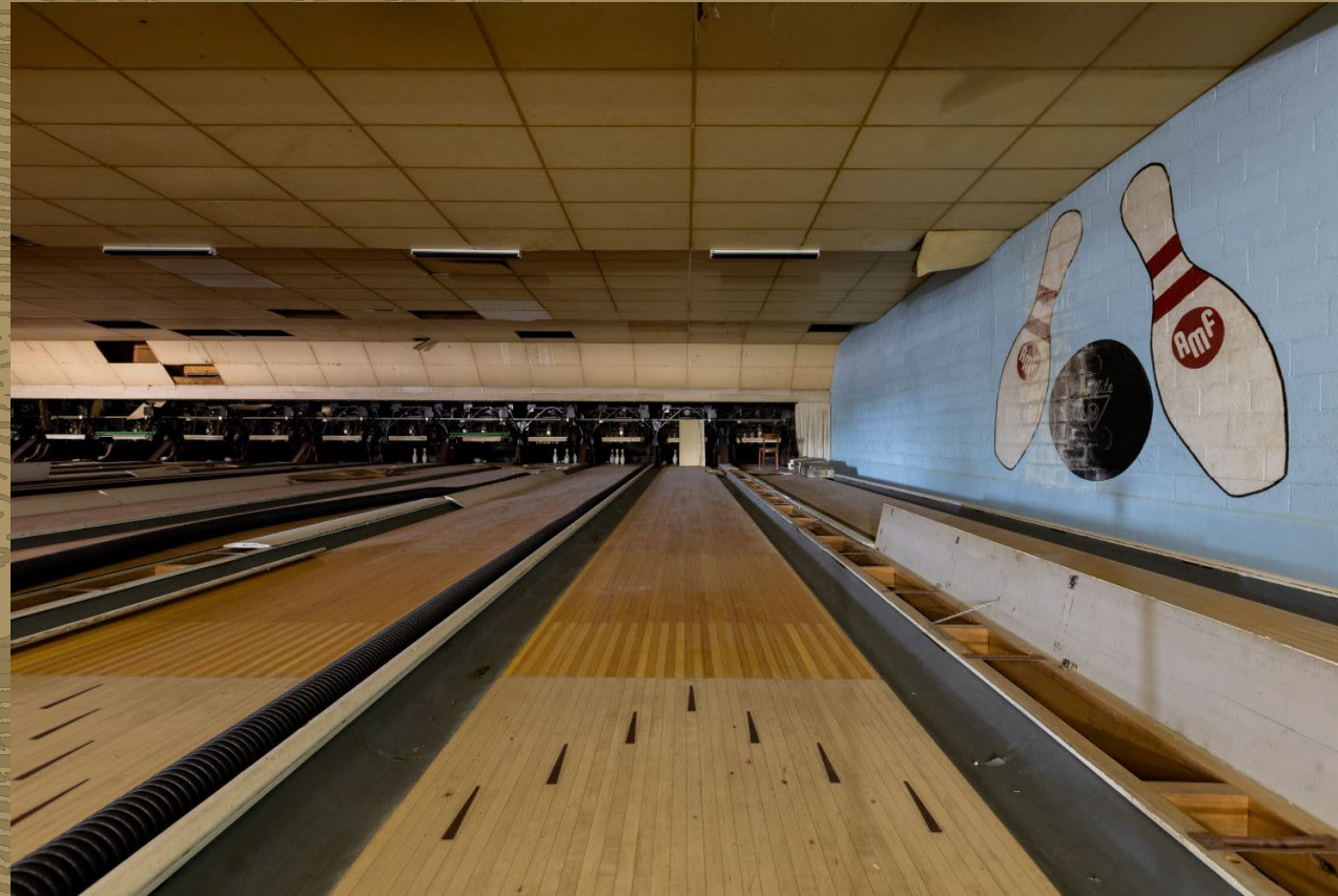
All Star Bowling Lanes, Orangeburg, SC