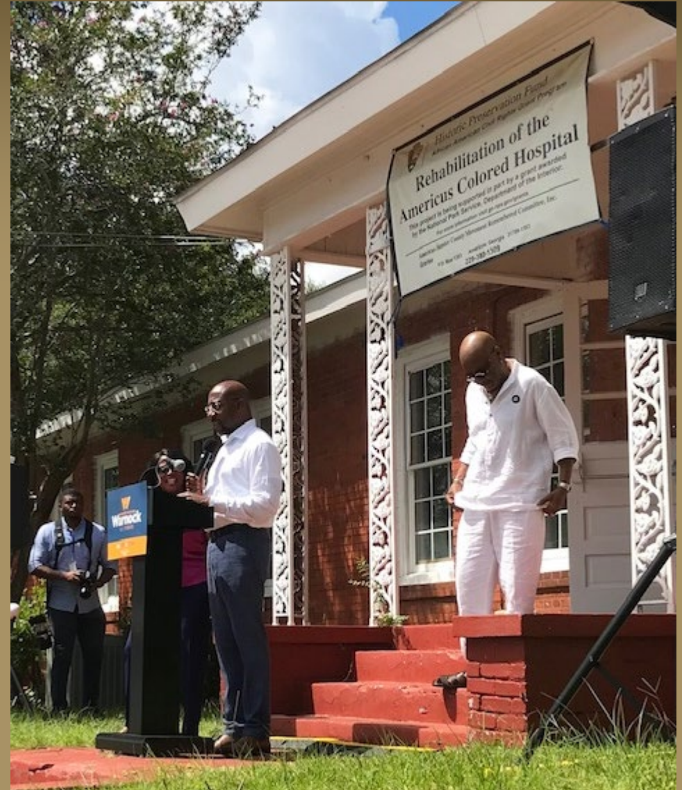
Americus Colored Hospital, Americus, GA