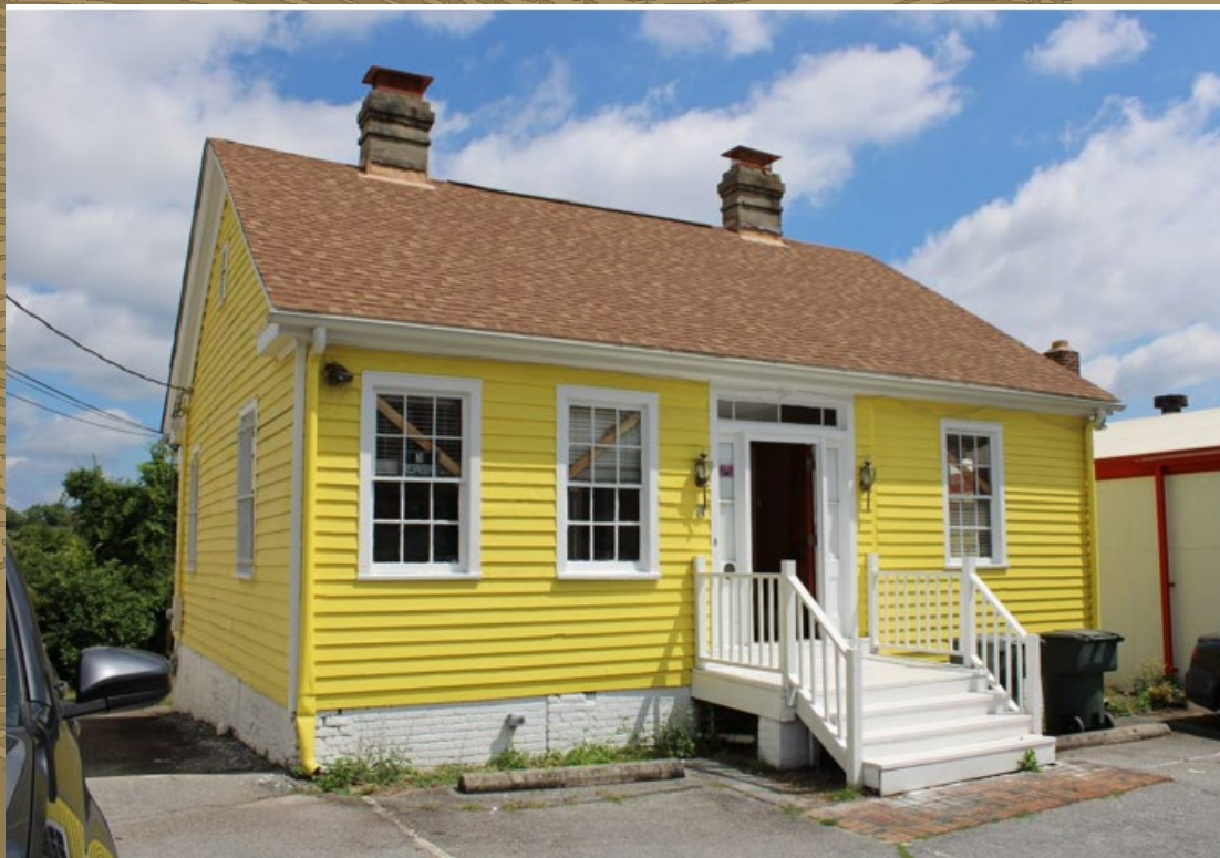
Alston House, Columbia, SC