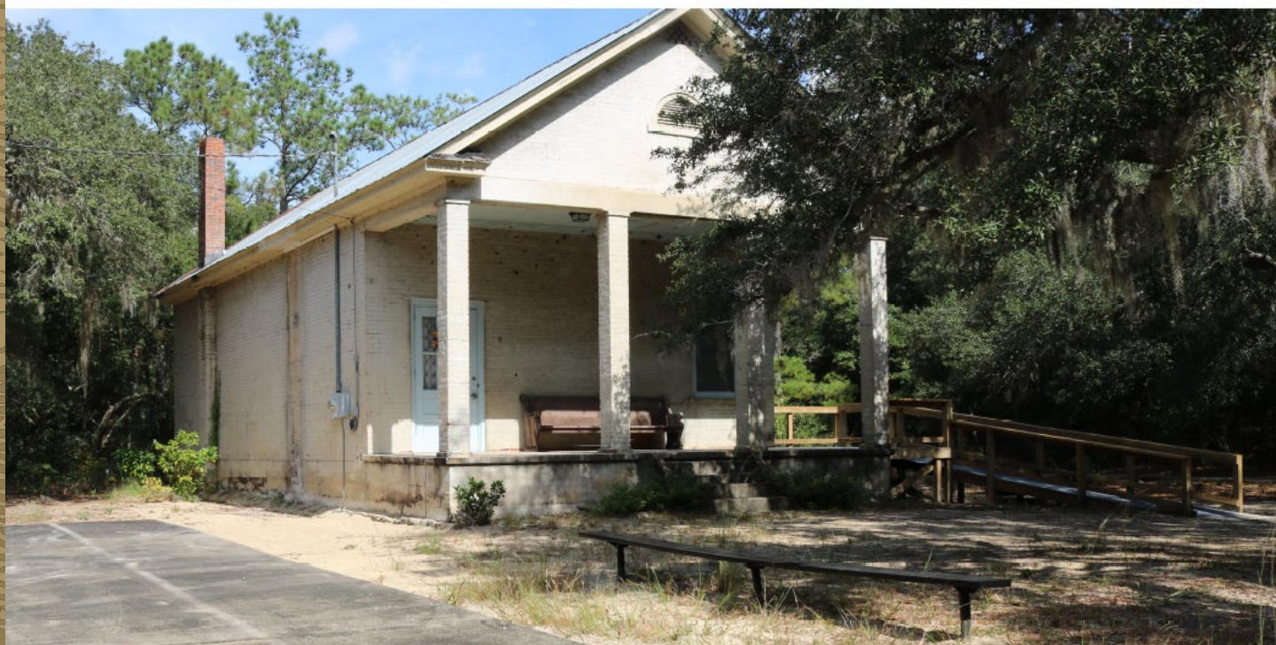
Sandy Island School, Sandy Island, SC