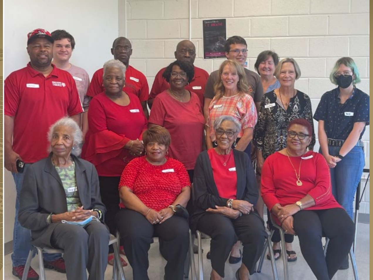
Edgewood School Alumni, Edgewood Community Center Executive Director and Lander History Students, and Volunteers, Old Ninety Six, SC