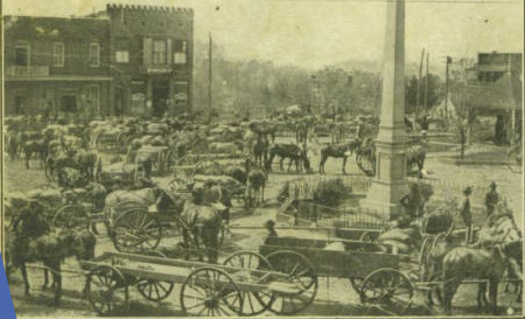
18c. View on Square, Edgefield, S. C.