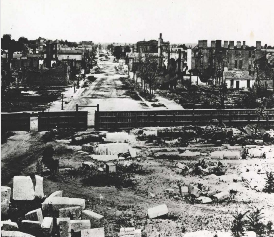
Columbia's Main Street , North from the State House after General Sherman's burning in 1865