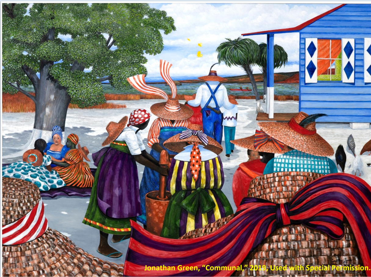
Jonathan Green, "Communal," 2019, Used with Special Permission.