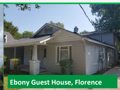
Ebony Guest House, Florence

We are pleased to announce that the historic house located on 1221 Pine Street, the former site of Ruth's Beauty Parlor , has been listed in the National Register of Historic Places!!!