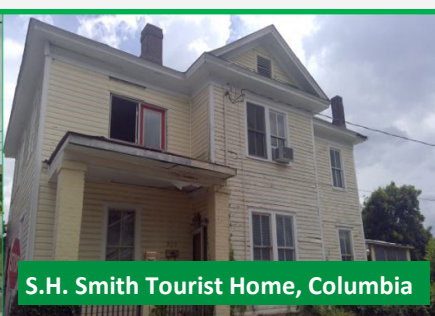
S.H. Smith Tourist Home, Columbia