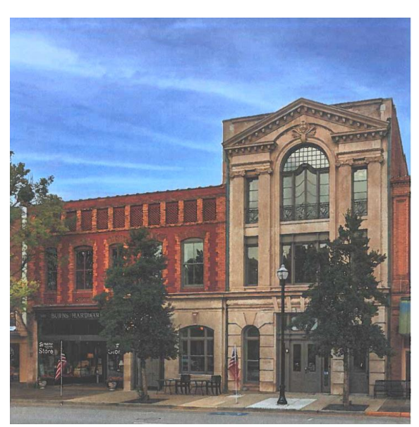
Photograph of the First National Bank of Camden after rehabilitation in 2021.