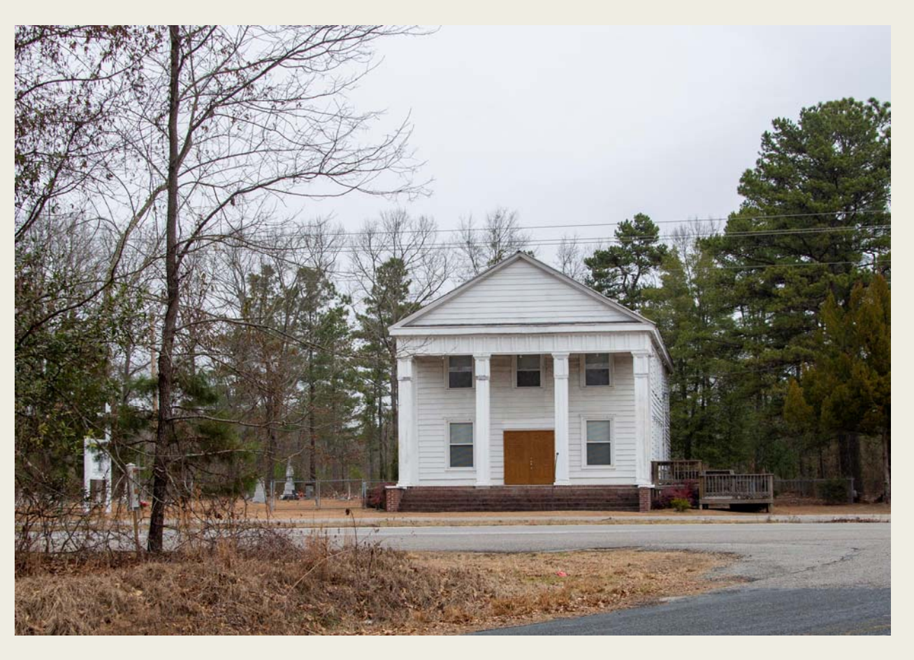
Good Hope Baptist Church-Eastover National Register